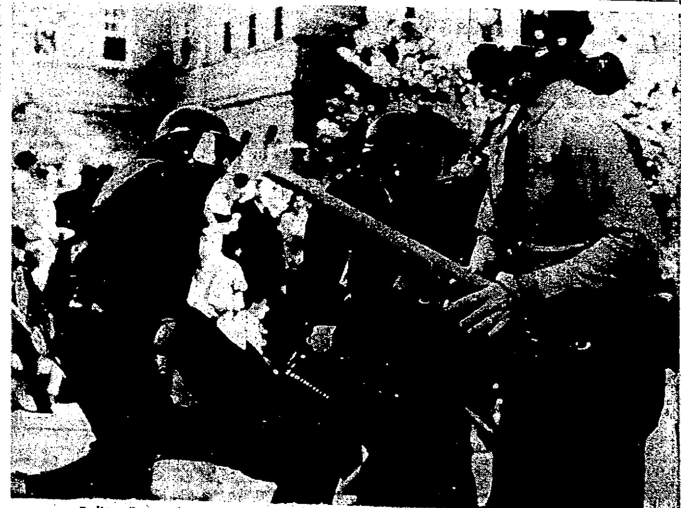
Police Carry One of Their Injured From Scene of Clash With Protesters

Protesters Carry One of Their Injured From Scene of Clash With Police